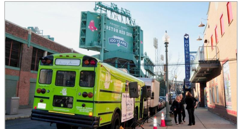
Fields of musical dreams!