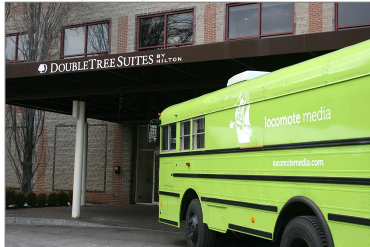
Everywhere the music comes alive