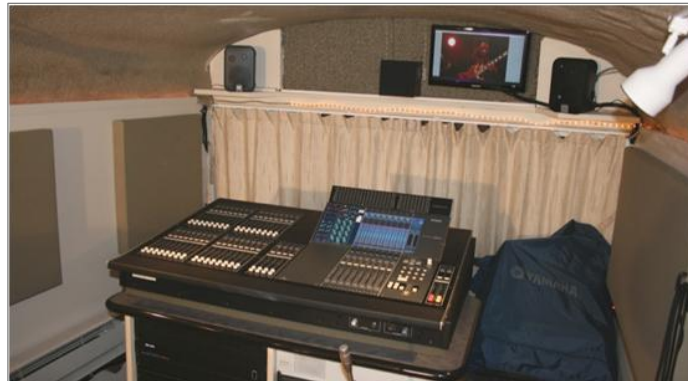
M7CL - Stage Monitor